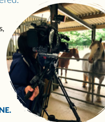
The story caught the attention of ITV and BBC who both featured the appeal on the local news.

From all of us, and every horse whose life you've touched, thank you!