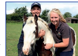
Happy and healthy. Buddy at HorseWorld

Visit us to learn more, and to find out how you can make a difference to horses in need