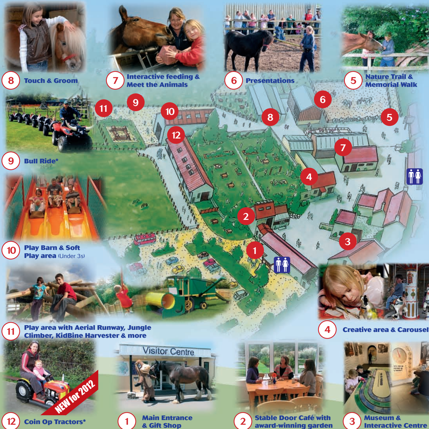
12 Coin Op Tractors*