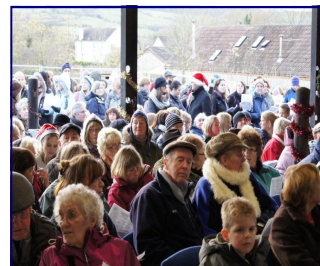
The well attended service in the shire horse barn

cheer all day. Proceeds from the event came to an amazing £6,669 which made all the hard work worthwhile and would have been impossible without you!