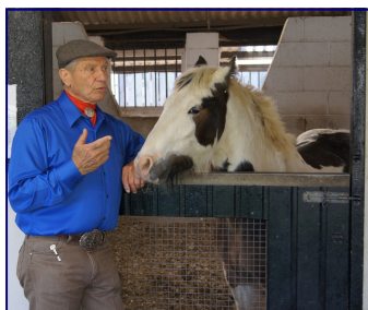
Monty Roberts meets Buddy at the visitor centre

The internationally renowned horse trainer and creator of the technique 'join up' spent a day with staff, volunteers and trustees, finding out more about our