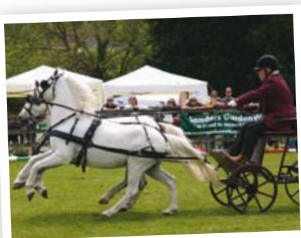
The Open Day in May*

Please make a donation today using the tear-off form, and help guarantee a safe future for the horses, ponies and donkeys in need.