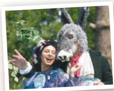
The open-air, Theatre in the Paddock

Supporting HorseWorld offers your company the opportunity to work with one of the most respected animal welfare charities in the region. We can offer marketing and promotional opportunities, excellent conference facilities and a wide range of events and activities that your company can get involved with or sponsor.