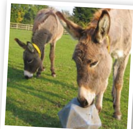
Donkeys at HorseWorld

Volunteers are vital in ensuring HorseWorld's continued success. We provide a host of varied opportunities that range from visitor services and tour guiding, to office-based work, bucket collections or helping out with fundraising events throughout the year.